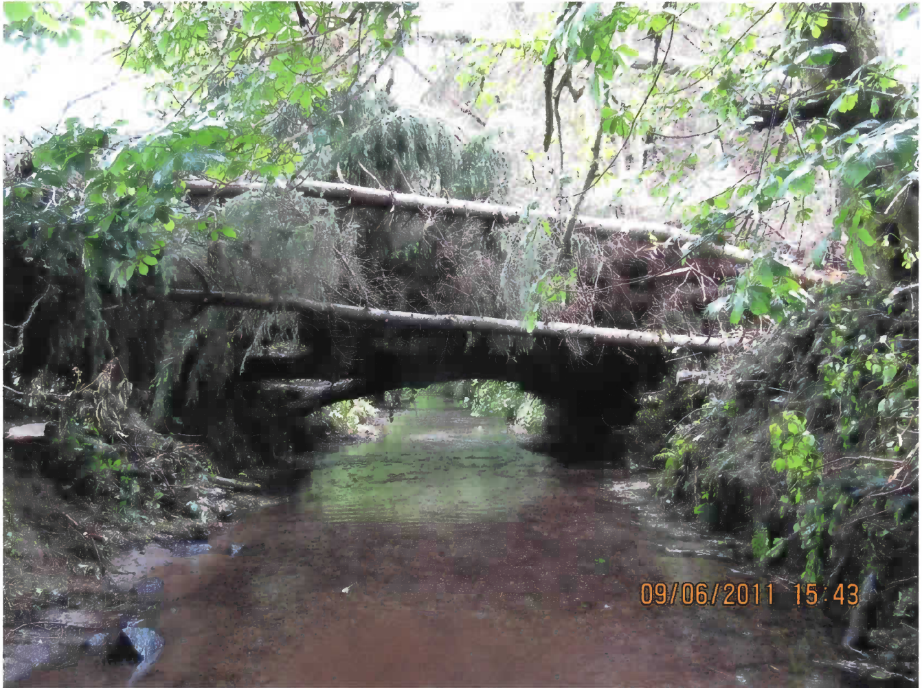
Picture 3 Goval burn flowing freely.

Now this burn has been completed we will be concentrating on the main river habitat survey and hopefully will hit the deadline set for the fishery management plan this year.